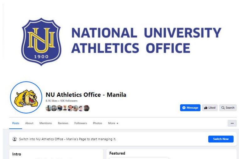
Figure 15. Facebook page of NU Athletics Office