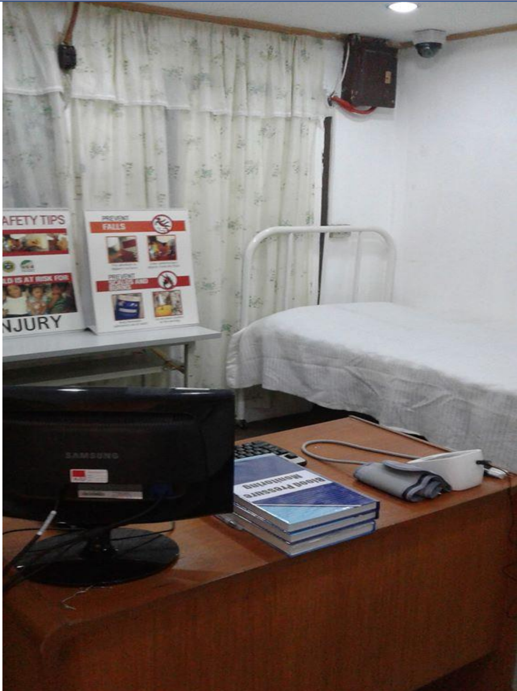
Treatment area of the Barangay Health Station

LAUNCH OF THE BARANGAY NU HEALTH STATION, A CENTER FOR HEALTH AND WELLNESS. THE HEALTH STATION IS MANNED BY COMMUNITY HEALTH VOLUNTEERS WHO WERE TRAINED BY THE FACULTY OF THE DEPARTMENT OF NURSING.